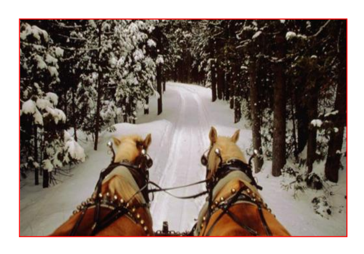
"Stopping by Woods on a Snowy Evening" by Robert Frost

Whose woods these are I think I know. His house is in the village, though; He will not see me stopping here To watch his woods fill up with snow.